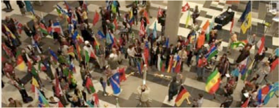
The Peace Pole Ceremony at the Parliament of World Religions.