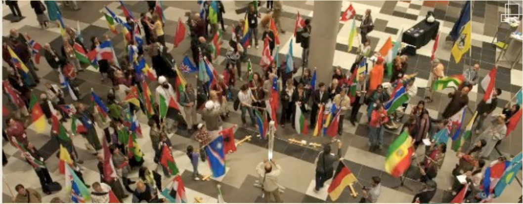
The Peace Pole Ceremony at the 2009 Parliament in Melbourne.