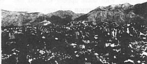
Quezon City Dump Site

Lord in His mercy has kept them alive and now is bringing them here to be in our family. We saw how the people in Manila lived the last time we were there, and we realized how rich we really are, even as lower middle class Americans. So in light of all this, we know that serving the Lord here is not a burden, but a privilege. We are so thankful again for all of you who have made this possible through your generous giving in service to our Lord.